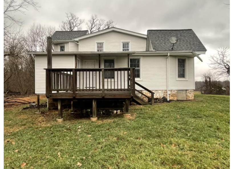
VIEW TO THE NORTHEAST