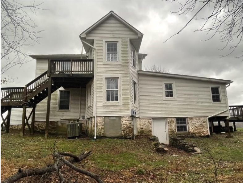
VIEW TO THE SOUTHEAST