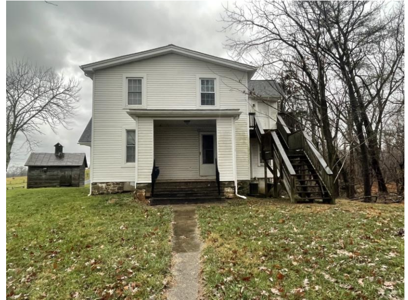
VIEW TO THE SOUTHWEST