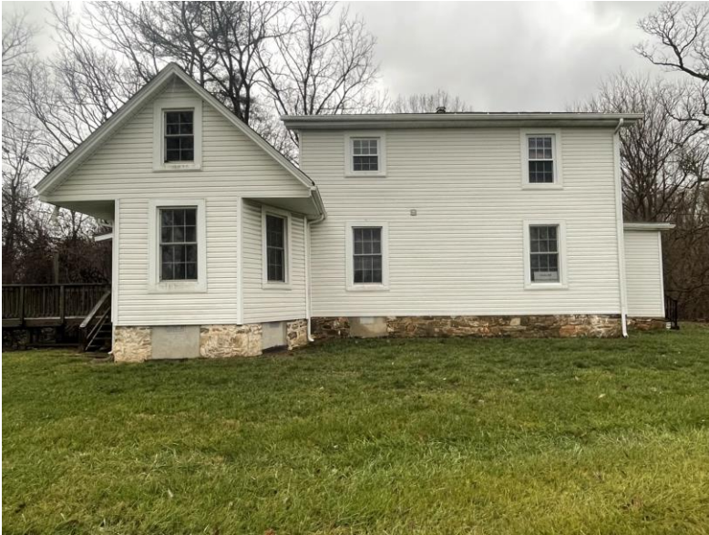
VIEW TO THE NORTHWEST